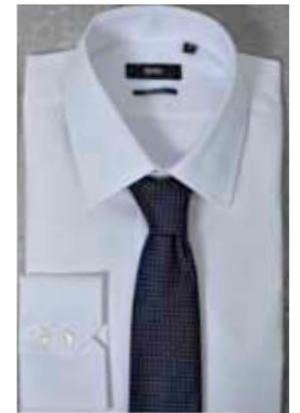
hemd boss, krawatte zzegna