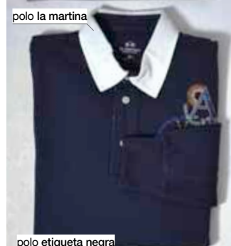
polo la martina