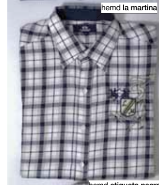
hemd la martina