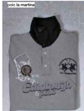
polo la martina