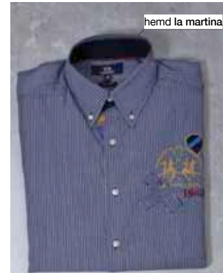
hemd la martina