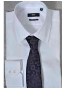
hemd boss, krawatte zzegna