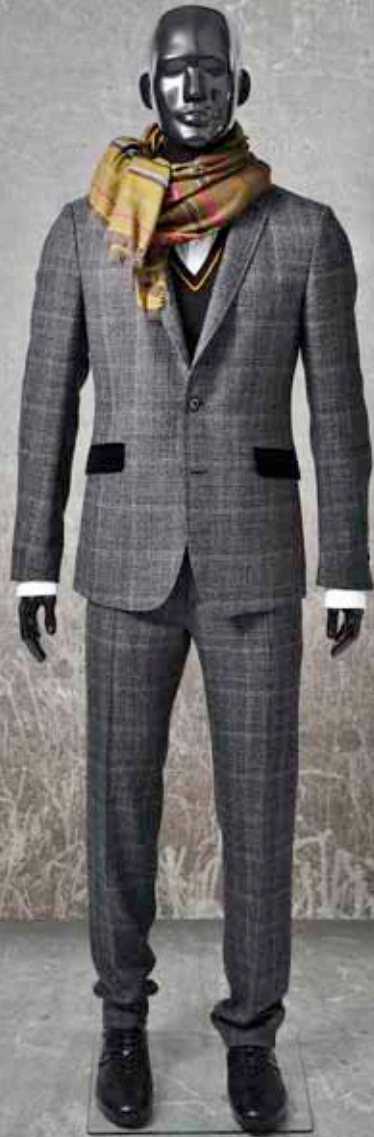
schal, anzug, pullover etro, hemd dior, schuhe prada