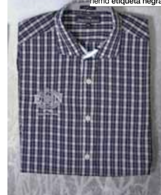
hemd etiqueta negra