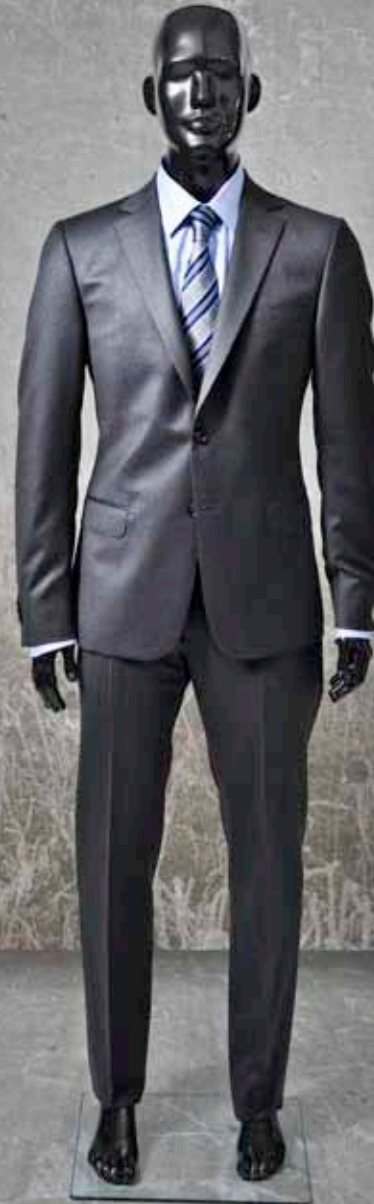
anzug, hemd zzegna