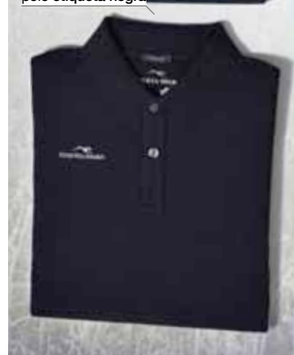
polo etiqueta negra