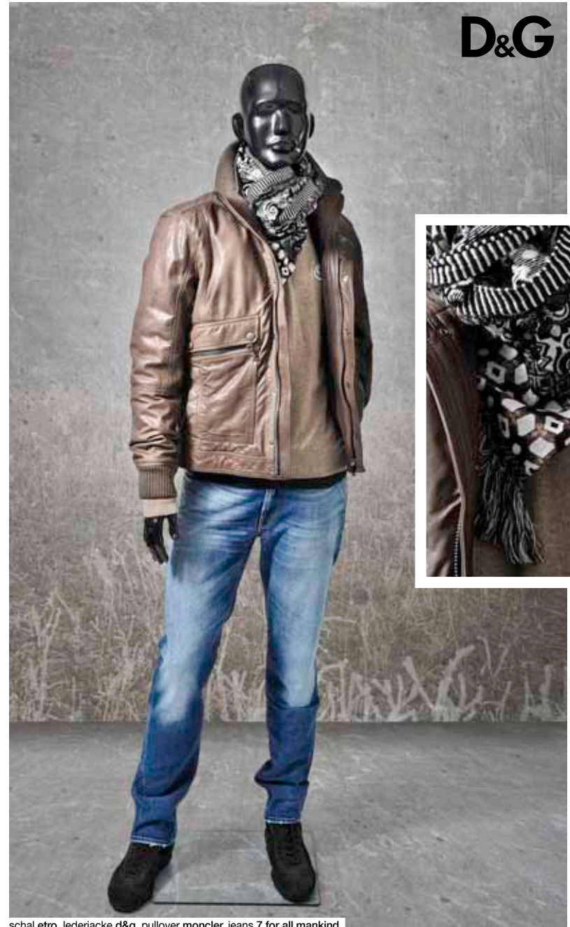
schal etro, lederjacke d&g, pullover moncler, jeans 7 for all mankind