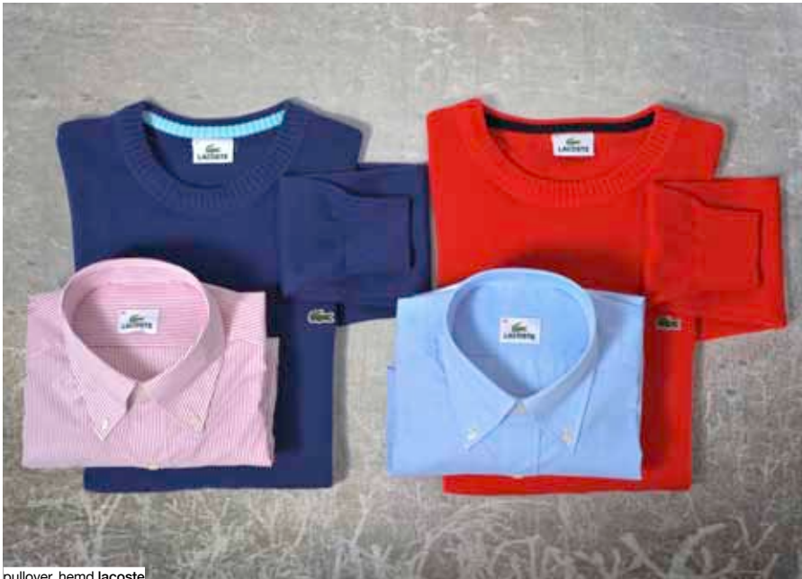
pullover, hernd lacoste