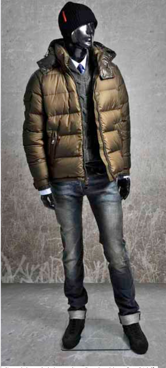
mütze, schuhe prada, jacke moncler, pullover, hemd, jeans dior, gürtel d&g