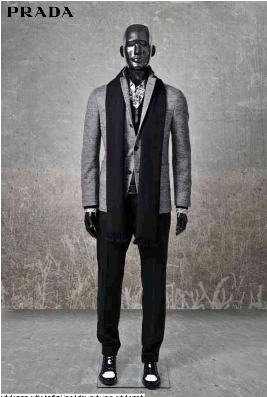
schal zzegna, sakko boglioni, hemd etro, weste, hose, schuhe prada